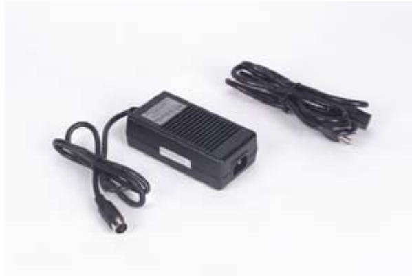
Power Adapter: PS-047A-3Y