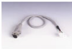
PS2 KB White